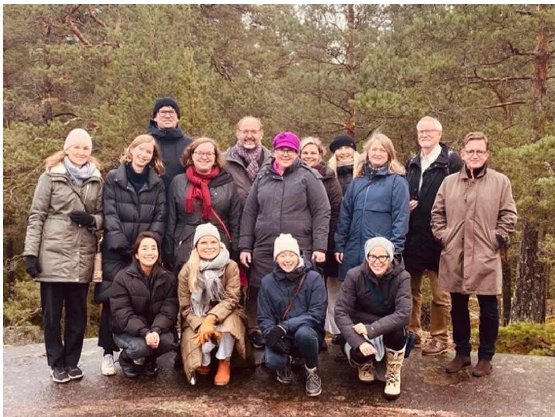
The NORDGREEN team on a health trail in Espoo.

Thank you to everyone who joined us in Helsinki&Espoo, we had a really nice time and good discussions meeting face-to-face! And for those who could not join, the minutes provide a good summary of where the project is at and where we are heading (towards the midterm evaluation)!